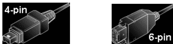
Picture 4: 4-pin and 6-pin FireWire connectors

Each node usually has three connectors, and up to 16 nodes can be connected in a 'Daisy chain' through the connectors with standard cables up to 4.5 m long for a total of 72 m. Special high-quality 'fatter' cables allow longer interconnections. Additional devices can be added in a leaf-node configuration (shown in the next figure). Physical addresses are automatically assigned to the devices on bridge power up (bus reset) and when a new node is added or removed from the system. Hot plugging of the devices is fully supported. No device ID switches are required.